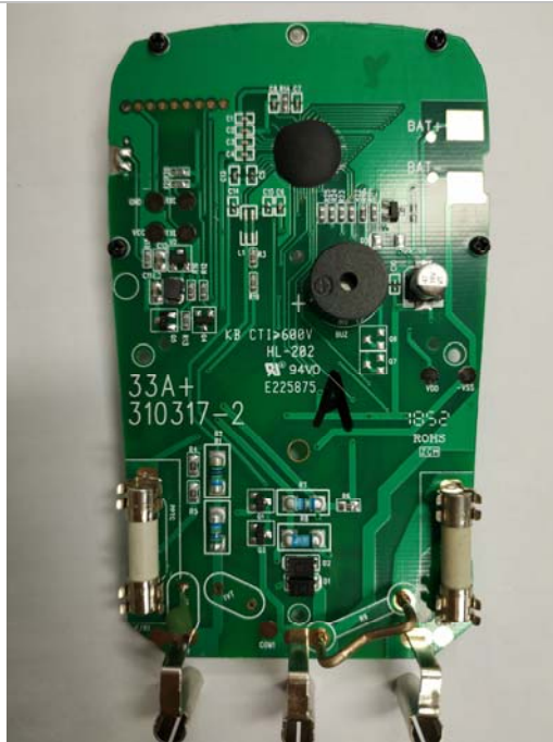
New PCB view of UT131A