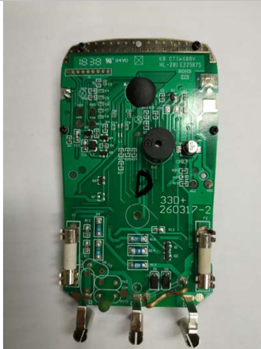
New PCB view of UT131D