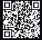
RUT241 360° VIEW

// RUT241 is the modified version of our all-time bestseller RUT240 that inherited its' best features, including industrial design, compact size, multiple connection interfaces, and compatibility with RMS.