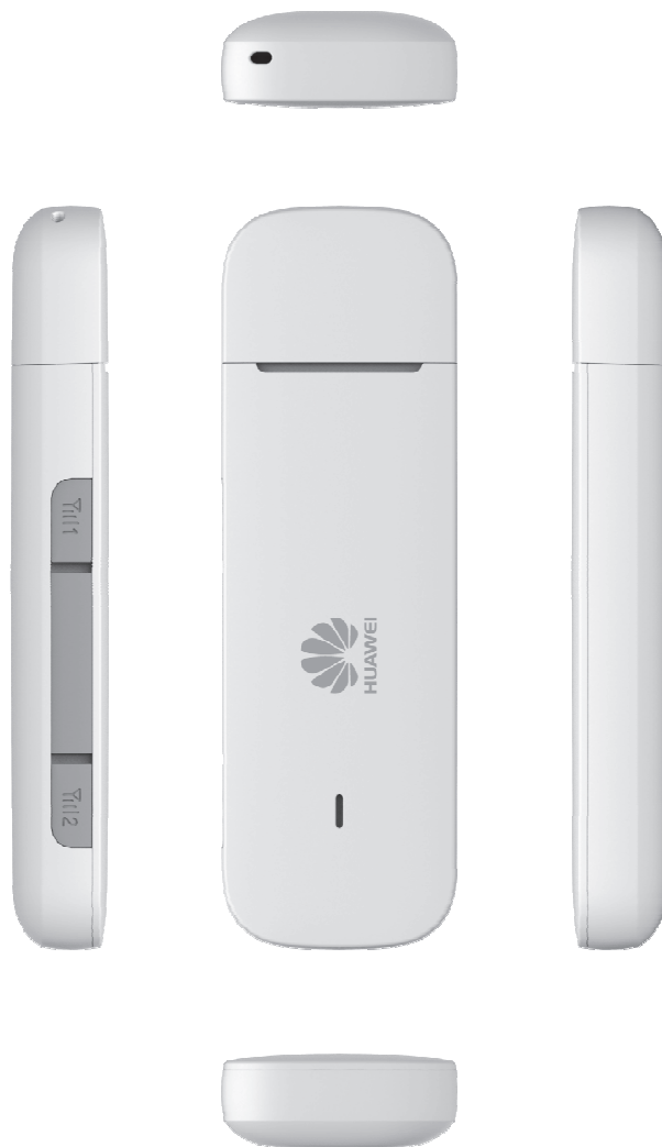
Figure 1-1 E3372h-320 appearance

In the service area of the LTE/DC-HSPA+/HSPA+/UMTS/EDGE/GPRS/GSM network, you can surf the Internet and send/receive messages/emails cordlessly. The E3372h-320 is fast, reliable, and easy to operate. Thus, mobile users can experience many new features and services with the E3372h-320. These features and services will enable a large number of users to use the E3372h-320 and the average revenue per user (ARPU) of operators will increase substantially.